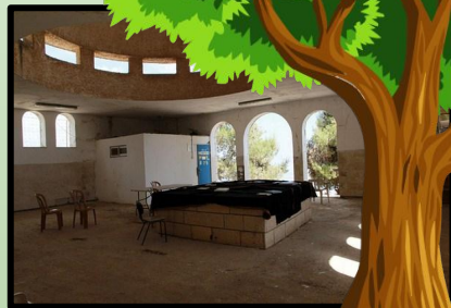
The Tombs of the Sages