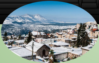
Winter in Tzfot