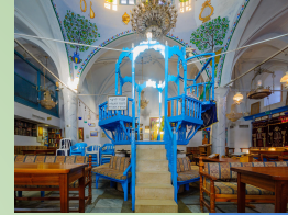
← Abuhav Synagogue