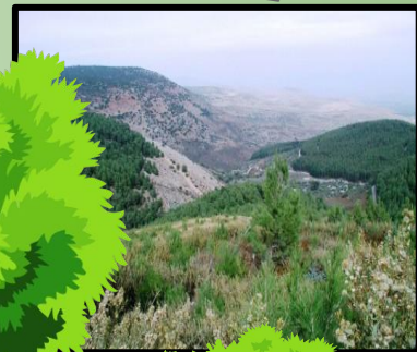
The Biriya Forest