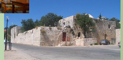
Red Mosque →

According to a count in 2019, the city of Tzfat has a population of about 36,000 people! While about 90% of all residents in Tzfat are Jewish, there is still a big Muslim community who live there due to its holiness! There are dozens of Muslim along with Jewish statues and monuments such as the Red Mosque of Tzfat (which was supposedly built by Momlukes) and the Abuhav Synagogue which holds great importance to the Jewish people.