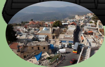
Summer in Tzfot