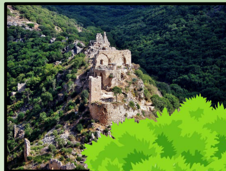
The Montfort Castle

בצפת יש הרבה מקומות ארץ היסטורית, אבל זה החשוב ביותר